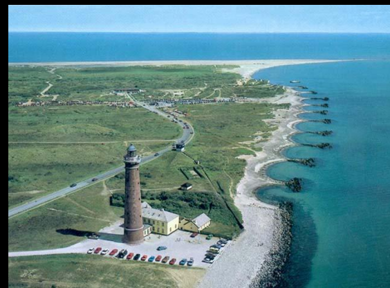
... neither does Skagen