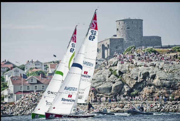
Marstrand don't need any further explanation