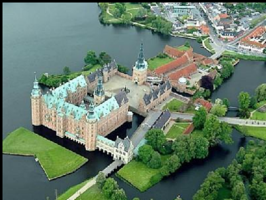
Gilleleje is situated just north of Helsingör